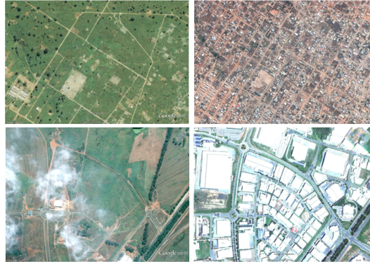
Fig. 1. ( from top-left clockwise ) Luanda,Angola [2003]; Luanda,Angola [2011]; Johannesburg, SA [2005]; Johannesburg, SA [2011]. The top row images show that how an empty field was completely taken over by housing development in Luanda within 8 years. Similarly, in Johannesburg (bottom row), a green field is totally lost in 6 years due to various developments.